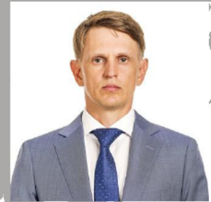
Owner and supervisor

We cooperate with manufacturers of tablet presses and we are engaged in deliveries of spare parts for any model of rotary tablet presses purchased in our company.